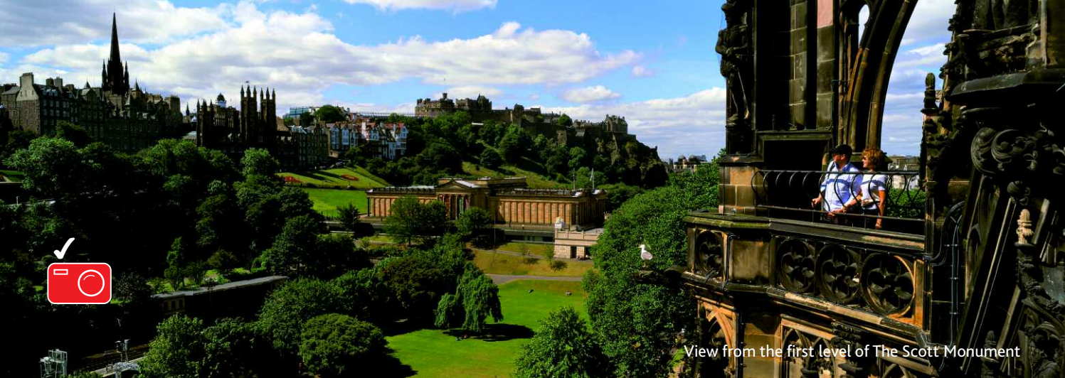
View from the first level of The Scott Monument