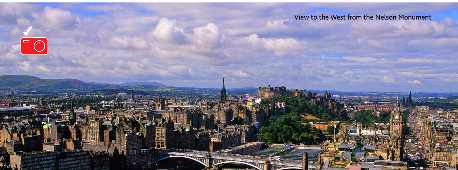
View to the West from the Nelson Monument

Perched high on Calton Hill in the heart of Edinburgh sits the monument to Admiral Lord Nelson. The best place to experience breathtaking views of Edinburgh's Old and New Towns, Arthur's Seat and the distant Forth rail and road bridges.