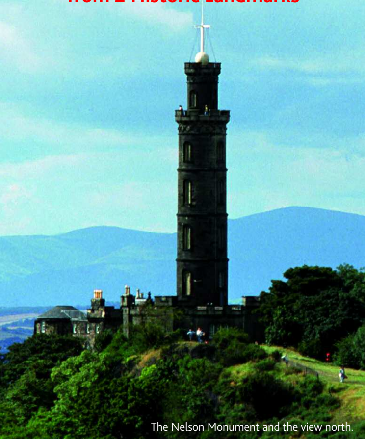
The Nelson Monument and the view north.

The Best Views of Edinburgh from 2 Historic Landmarks